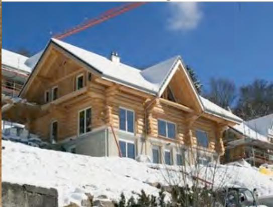
This is almost how our house will look when its done - This is Tobler's house next to ours.