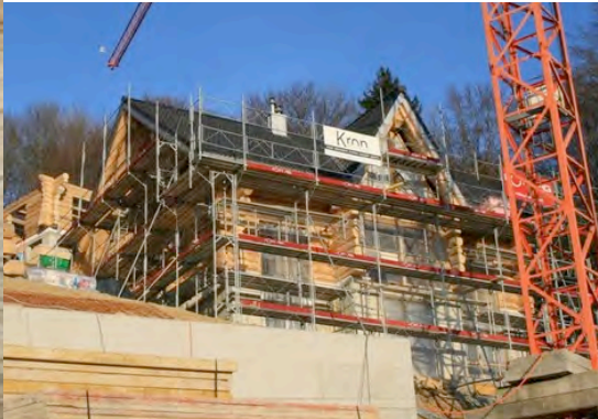
This is our house being built